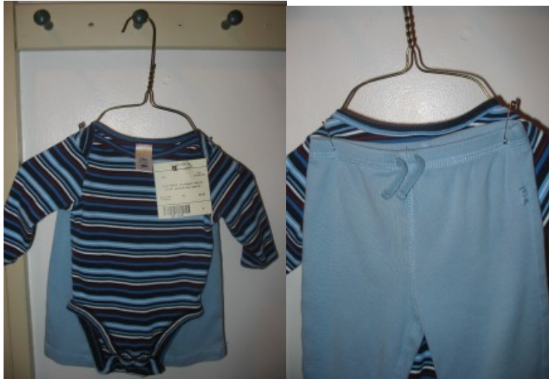
Front of 2-piece hanging item