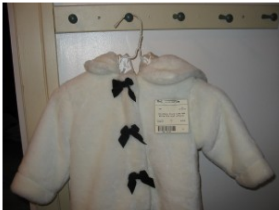
Coat with proper tag placement